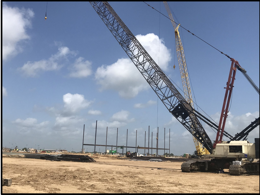
Steel Erection started