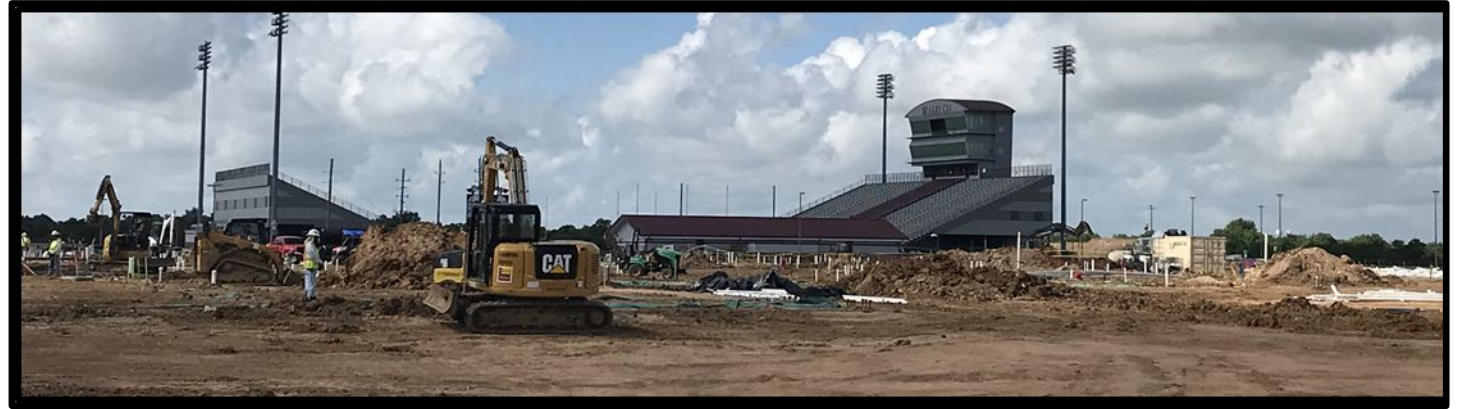
Underground Plumbing and Electrical