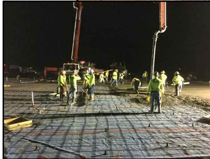
Slab on Grade (SOG) Concrete